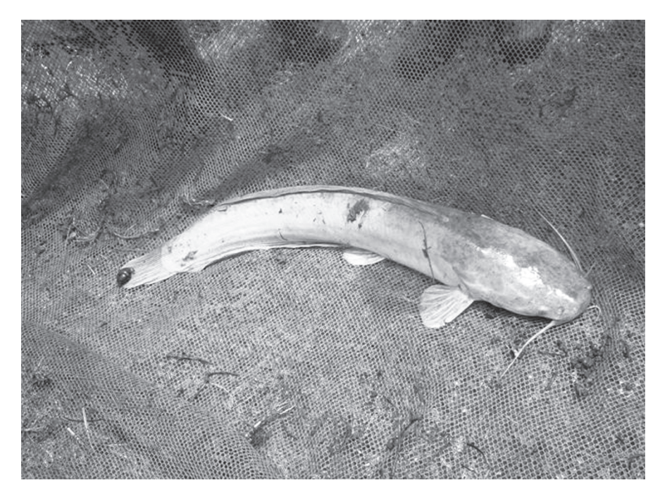
African catfish (C. gariepinus) pulled from a SUMAWA pond. The water quality parameters in the River Njoro watershed made it difficult to culture the African catfish in ponds at high altitudes. No eggs from this species hatched, indicating that attempts to get the fish to spawn were unsuccessful.

months during which growth performance and pond water quality changes were monitored. Artificial spawning was conducted with Nile tilapia using mature fish, which were purchased from Sagana Aquaculture Center.